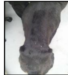
Hope when she first arrived. On the left a full body shot; on the right her body condition