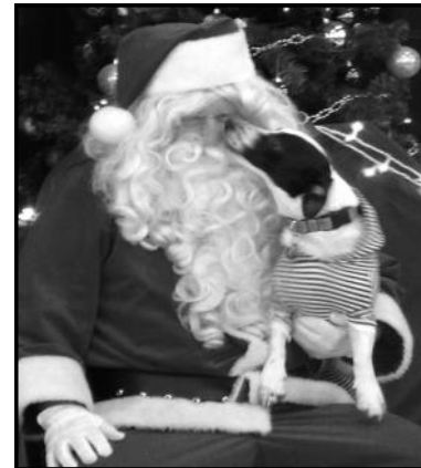
Santa Photos are always popular! Lucky Santa gets lots of kisses!