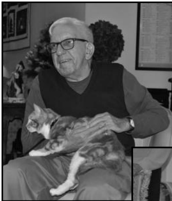
Tiny's Ties and friends visited Ste. Anne's Court and made some residents very happy!

Thank you from the Board of Directors, the staff of the FSPCA and all the animals you helped in 2015!